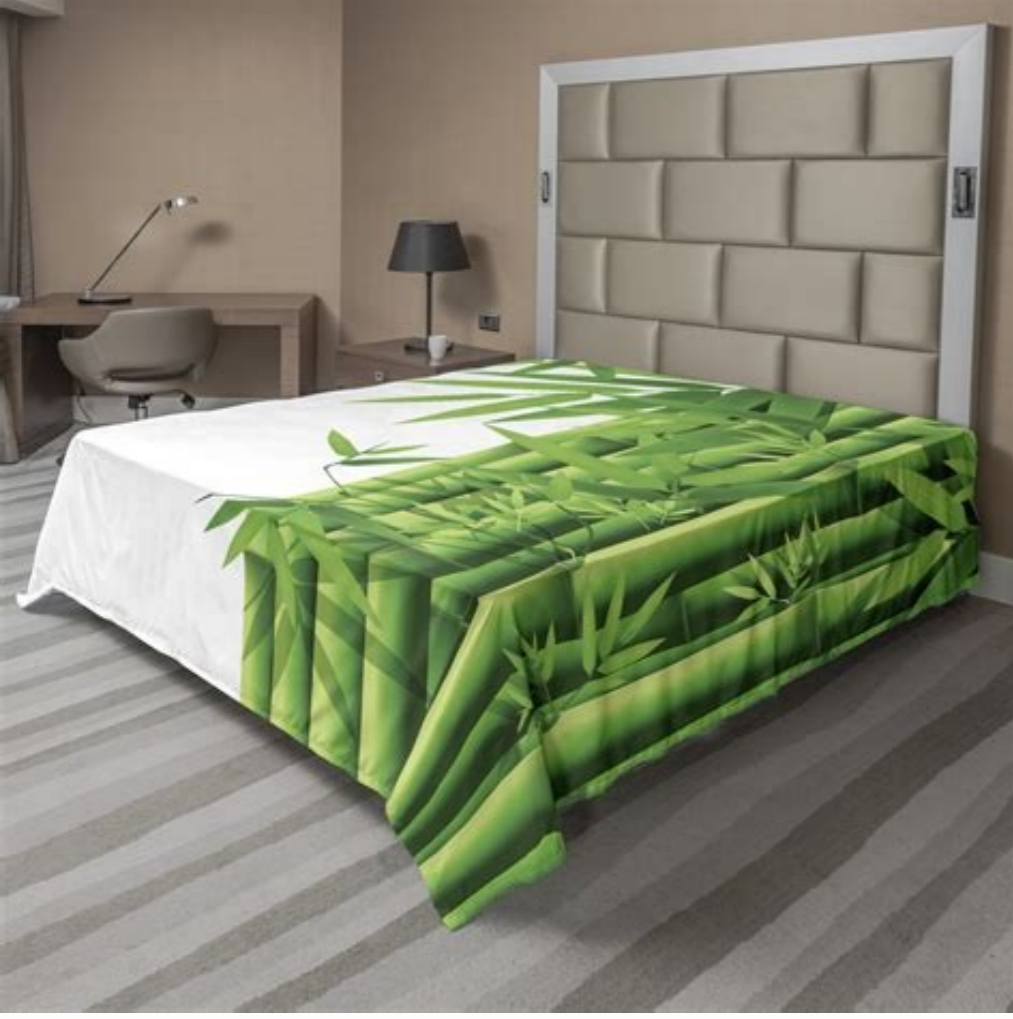
100 organic bamboo lyocell sheets. Best lyocell bamboo sheets.